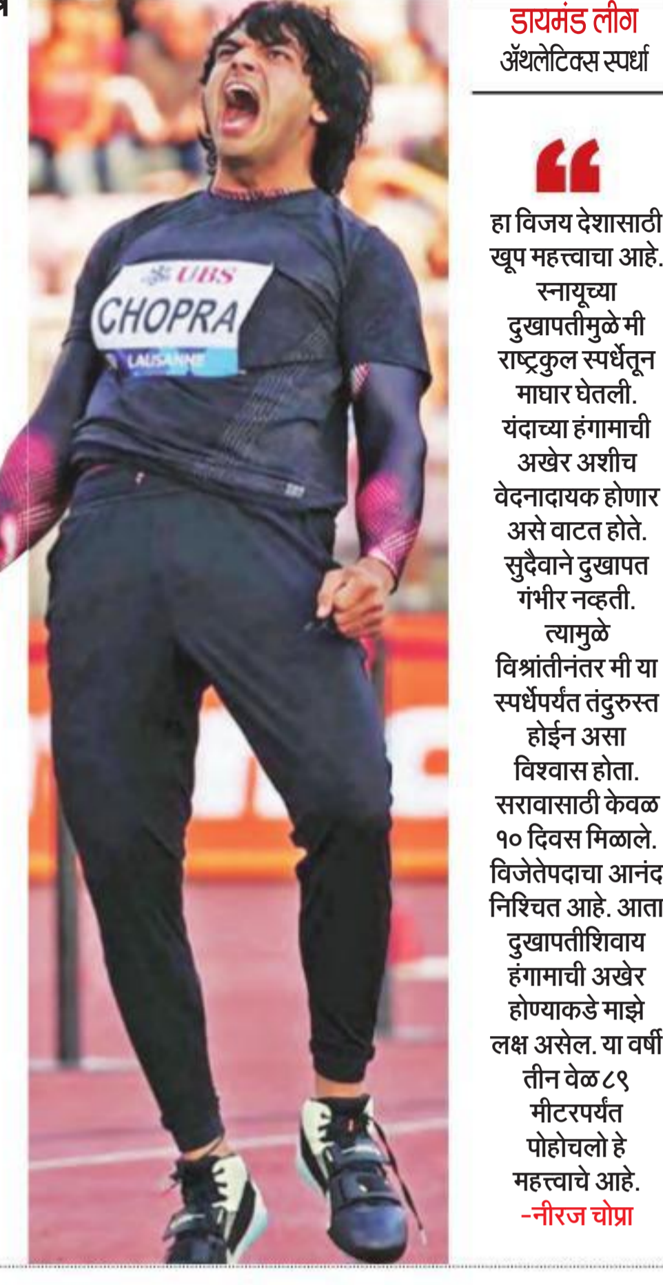
डायमंड लीग अँथॅलेटिक्स स्पर्धा

करून दुसरा क्रमांक मिळवला. अमेरिकेच्या कर्टिस थॉम्पसनने (८३.७२ मीटर) कांस्यपदक मिळवले. डायमंड लीग मालिकेतील दुसऱ्या टप्प्यातील स्पर्धेनंतर नीरज दुसऱ्या स्थानावर होता. या टप्प्यात ग्रेनाडाचा अँडरसन पीटर्स ८९.९४ मीटरच्या कामगिरीसह विजेता ठरला होता. या महिन्यात ग्रेनाडातच बोटीवर झालेल्या हल्ल्यात तो जखमी झाला होता. त्यातून अँडरसन अजून बरा झालेला नाही. नीरज जागतिक स्पर्धेत तिसऱ्या प्रयत्नांपर्यंत पदकाच्या शर्यतीत नव्हता. येथे मात्र पहिल्या प्रयत्नापासून नीरजने अखेरपर्यंत आपली आघाडी राखली होती.